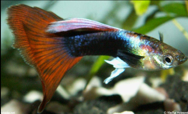
Guppy, Poecilia reticulata